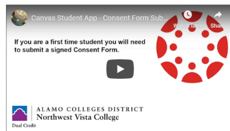
Photo or PDF with Canvas App , Google or Apple

Instructions on how to upload the consent form with the Canvas Student App are below.