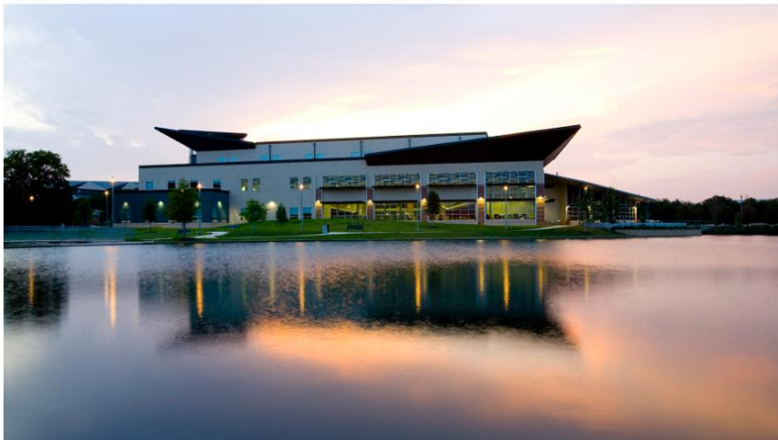
Welcome to Northwest Vista College

This is a creative endeavor that is supported by the College's guiding spirit of our vision, values, and mission. The purpose of this guide is to assist you to understand and negotiate all aspects of your responsibilities as a member of Northwest Vista College and within the Alamo Community College District.